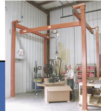
CTM Integration Inc.

TOLL FREE 1.877.KUNDEL3 www.snaptrac.com www.kundel.com