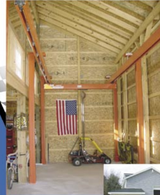
Home Owner Interior & Exterior